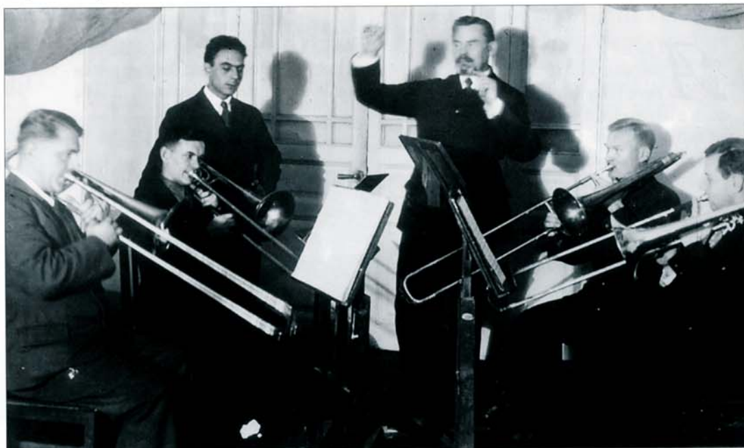
Session of the wind and brass faculty (Leningrad Conservatoire, 1938)

All of Reiche's versatile musical life is the best possible example of service for art and music. His contribution to the St. Petersburg school of trombone is great.